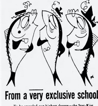
We pack only the tender, smaller ones under our Star-Kist Tuna label!